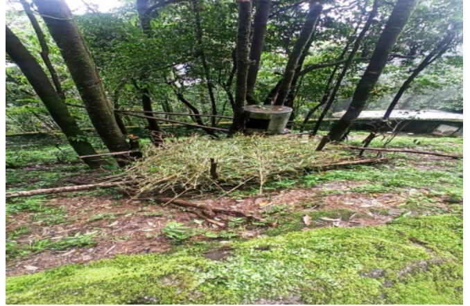
Platform for bamboo leaves for Red Panda at Old C.B.C