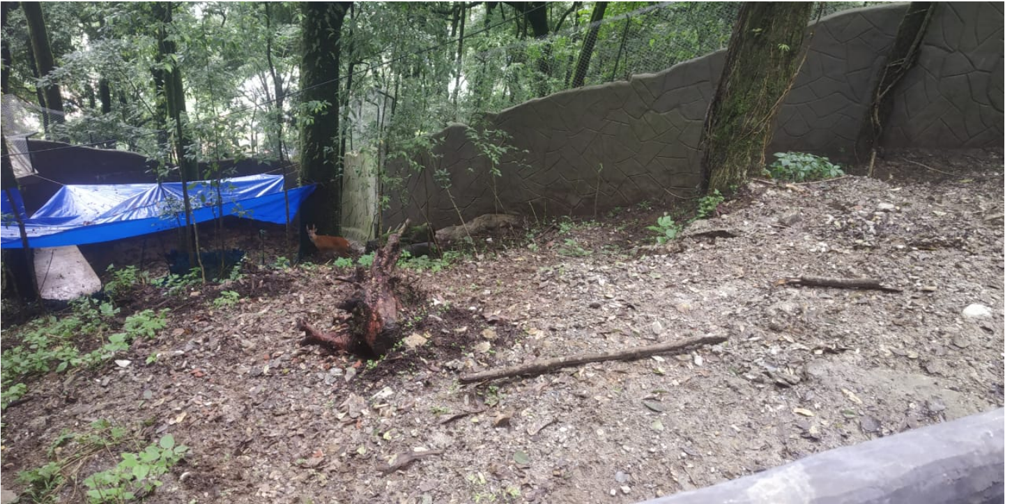
Construction of new herbivore enclosure