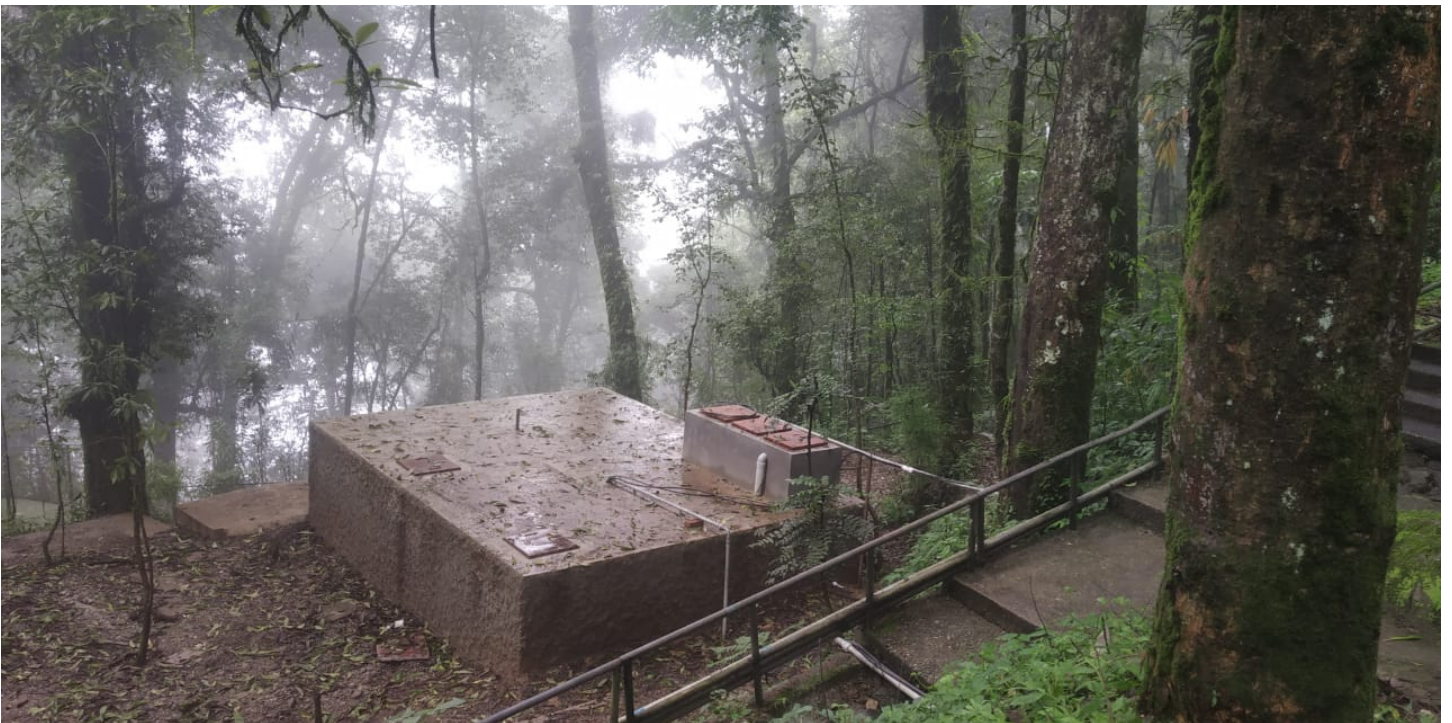
Construction of rainwater harvesting tank