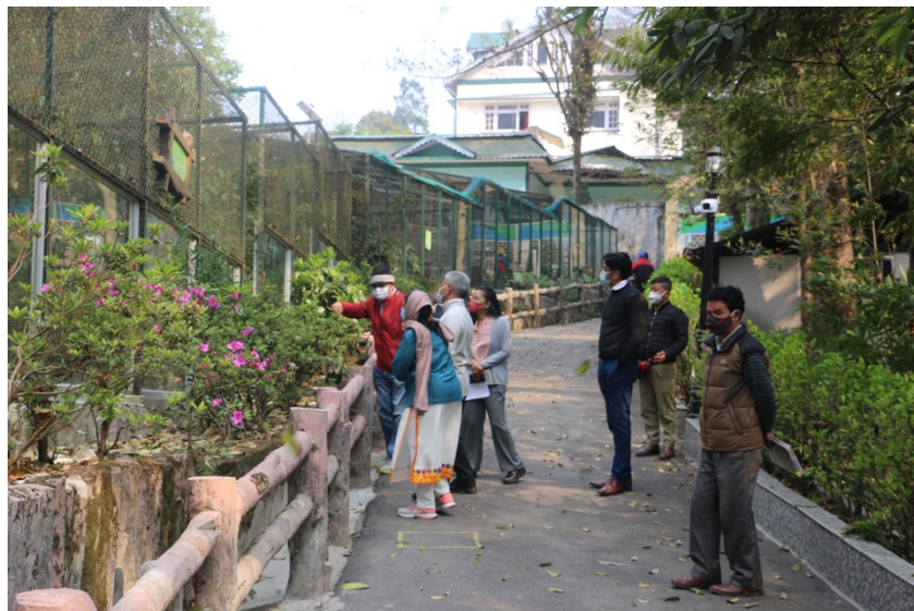
Visit of Dignitaries