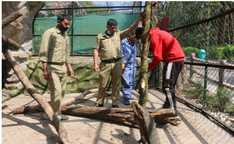
New logs by replacing old ones