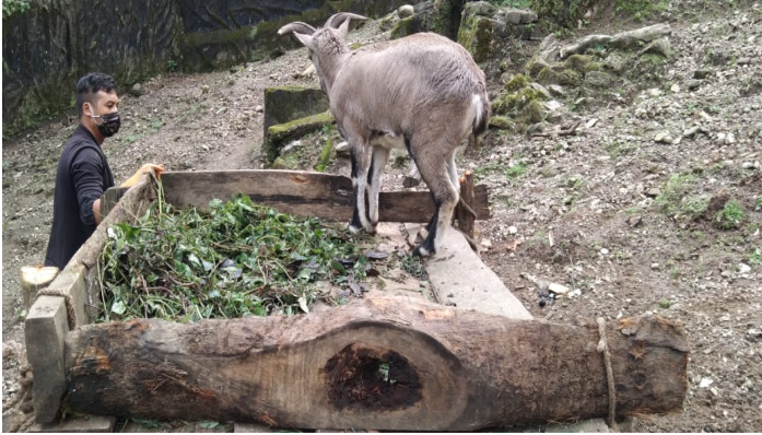
Platform for green fodders/ grass